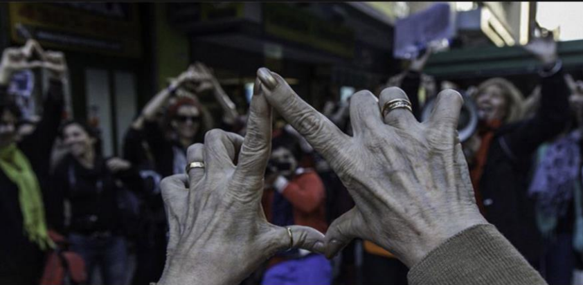
En la Plaza, en la Casa, en la Cama. Ensayo para una cartografía feminista – Guided tour/action by feminist group of artistic activism Mujeres Públicas. May 4th 2013, Buenos Aires.