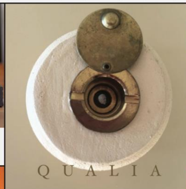
Qualia audio docu by Charo Calvo soundcloud.com