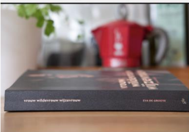
Vrouw Wildevrouw Wijzevrouw book by Eva De Grootte evadegrootte.be

book | podcast | art | photography | craft | poetry | film | documentary | music | magazine | photo | website